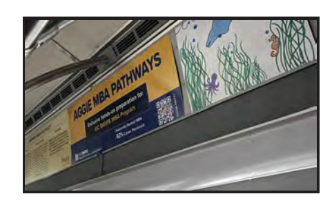
Images of 30"x11" interior advertising cards installed in bus interiors.